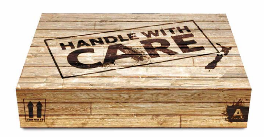
Figure 4 The Bid Document - World Masters Games 2017